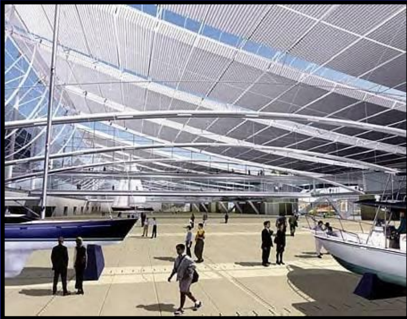
David L. Lawrence Convention Center