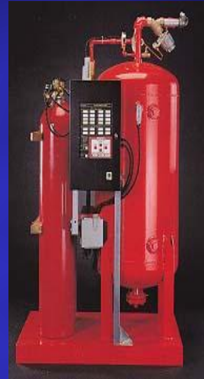
Water Mist System