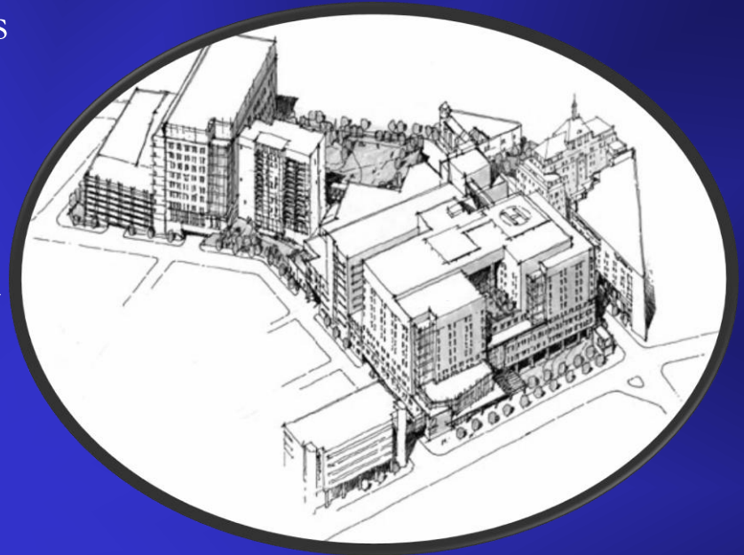
UPMC Children's Hospital in Lawrenceville